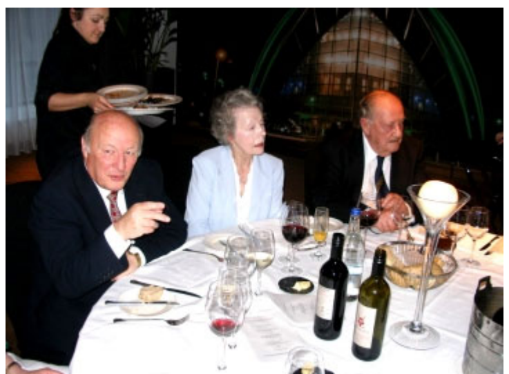
AGM Gala Dinner