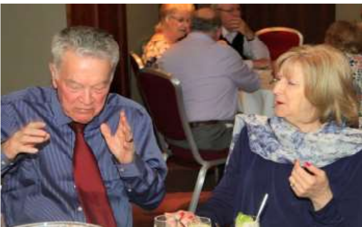
"The fish I caught yesterday was this big!"