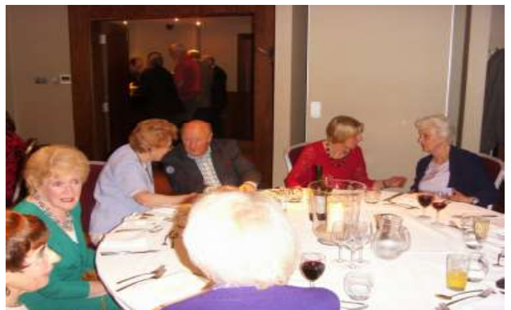
Night of the round table?