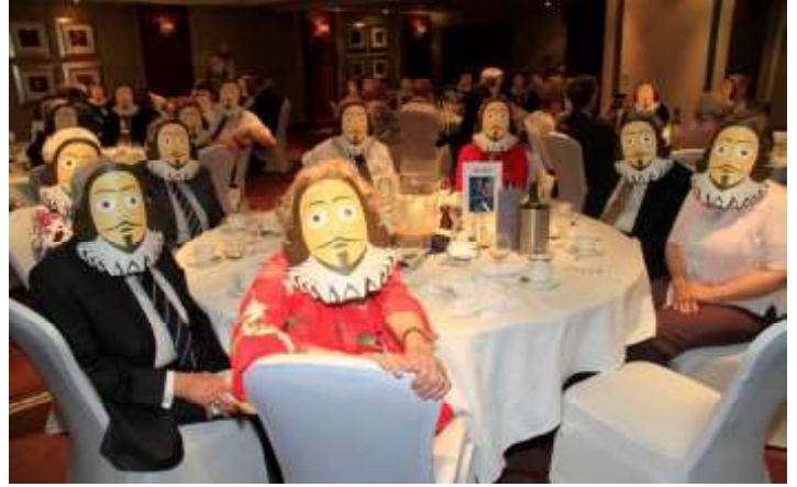
Do you recognise anybody?