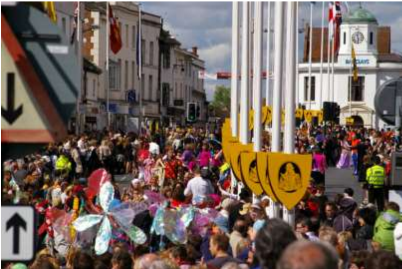
(Left) Grand Parade Stratford-upon-Avon

Details of the 2017 AGM and its booking form will be published in the December issue of “ Contrail ” and will also be available on the website as usual. Let’s ensure that it is another great success by booking early for what we hope will be another enjoyable weekend.