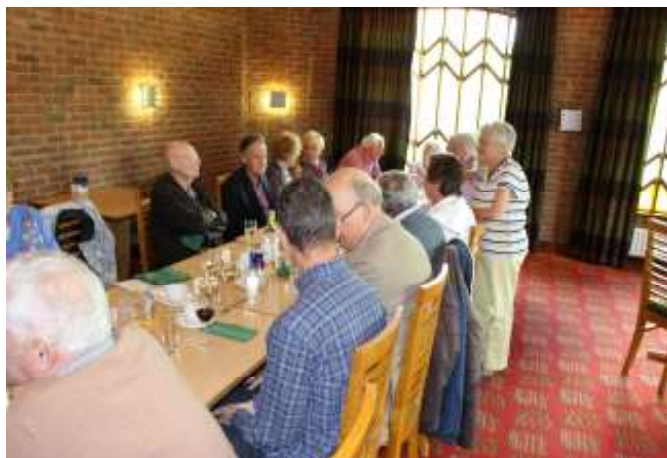
Northern Ireland Branch AGM & Lunch