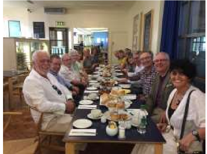
Members enjoy Afternoon Tea after a backstage tour of the Royal Exchange Manchester

Monthly walks remain popular within the Branch, with recent visits to Macclesfield basin, Whitegate and Monyash. A recent lunch in April at Great Budworth attracted twenty-five members. Fifteen members recently enjoyed a backstage tour of the Royal Exchange Theatre in Manchester. Walks are planned to continue monthly with Macc Vets along with bi monthly lunches at local country pubs. It is also hoped to arrange a tour of the Thomas Cook Maintenance hangar at Manchester Airport for those with aviation withdrawal symptoms. Also many are looking forward to a visit to the Avro Heritage Museum in Woodford on 13 July