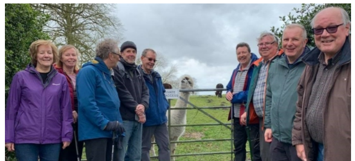
Wessex Branch News on page 5

Stay safe everyone & we hope we can meet up again soon.